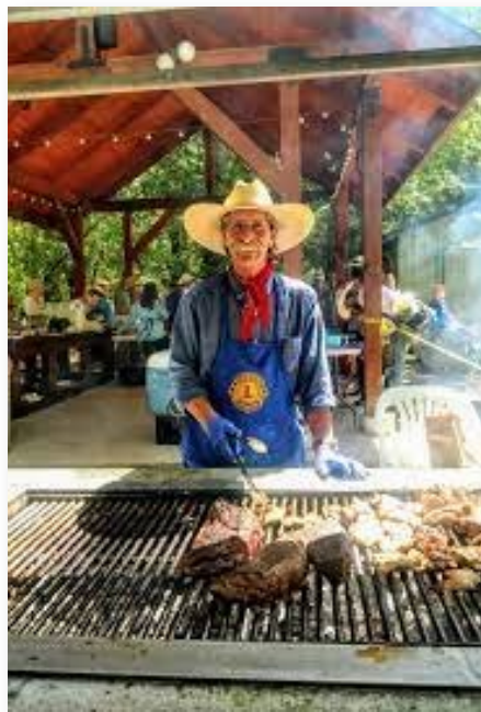
Blackberry Cobbler Festival 2019

Humans first migrated into the Cobb Area over 10,000 years ago (some studies say nearly twice that long). During that whole time, and until very recently, the land was occupied by a thriving culture of indigenous people well-integrated with the natural landscape and living well on the abundant local resources 36 . Once Europeans arrived in Cobb, the new human inhabitants built a culture based on extracting as much short- to medium-term value as possible from the land. Initially established as individual land stakes around prime stands of old growth timber 37 , these pioneer outposts thrived on a spirit of fierce individuality and self-reliance that remains a strong strand of the local character.